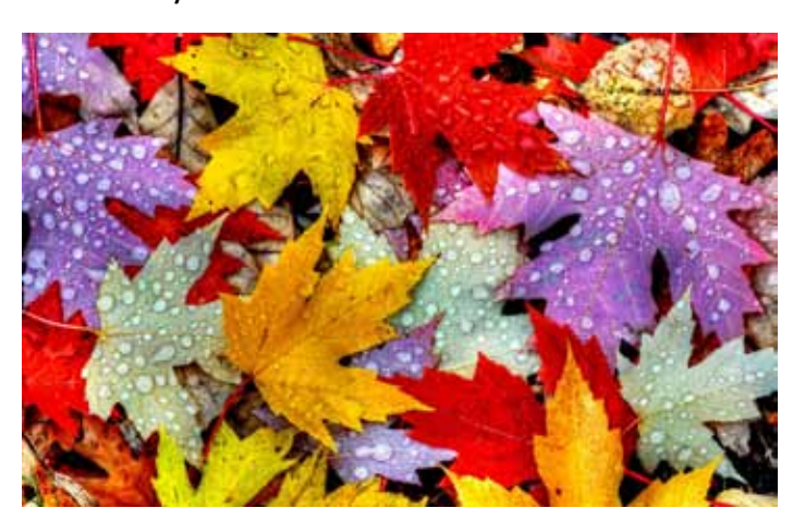
—Leigh Hatton (Acting Editor)

As usual, summer flew by but we are looking forward to autumn: the cooler weather and all the beauty that comes with it.