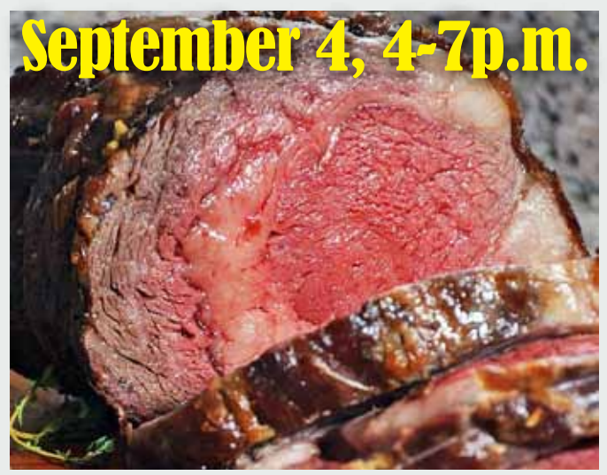
Prime rib, au jus, choice of potato, roasted seasonal vegetables and salad for $24.