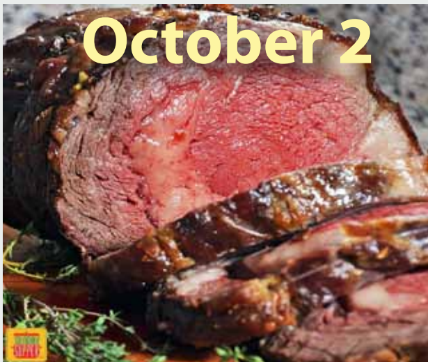
Prime rib, au jus, choice of potato, roasted seasonal vegetables and salad for $24.