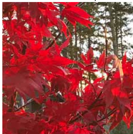
Sheree Hicks (Acting Editor)