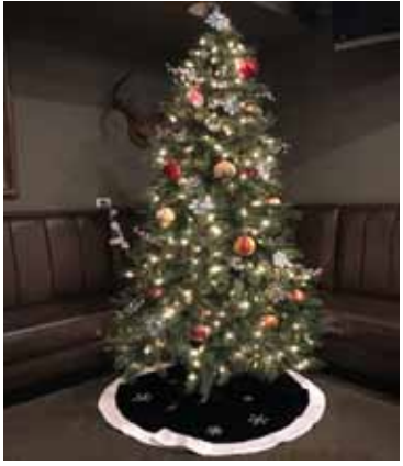
Sheree Hicks (Acting Editor)