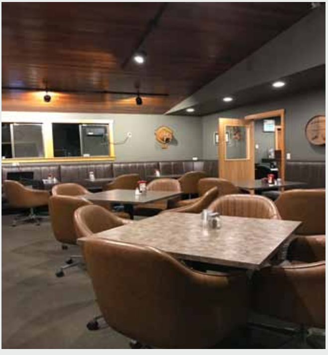
Hoping, in the New Year we will soon be able to take advantage of our wonderful dining facilities.

For take-out, please call your order in advance