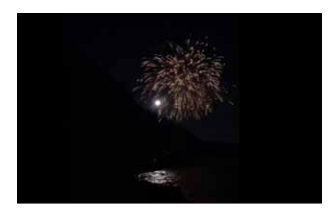
Fireworks and Full Moon over Holmes Harbor, Whidbey Island

Thank you all for your continued support!