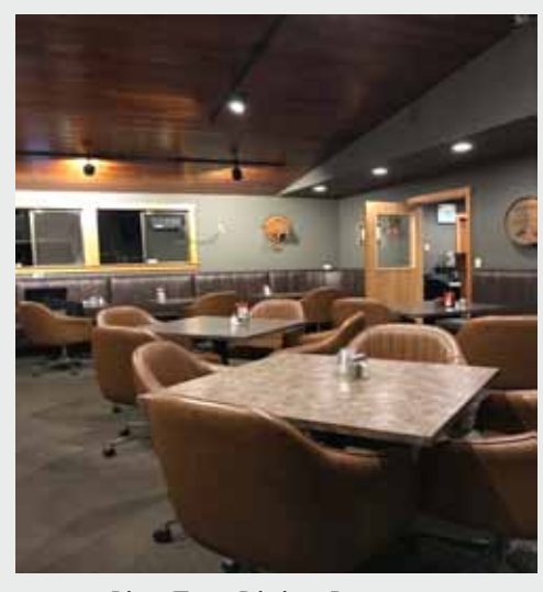
Pine Tree Dining Room

For take-out, please call your order in advance to (360) 221-8494 so it's hot, ready and waiting when you arrive to pick it up!