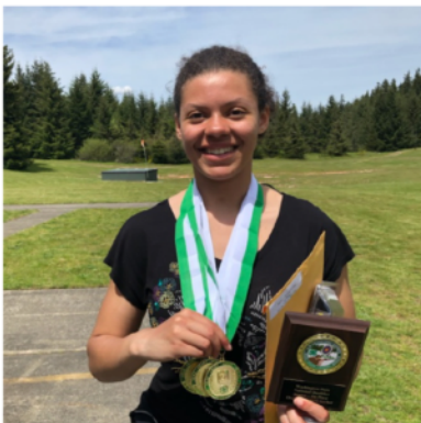
4-H Washington State Recurve Archery Champion

For tickets contact: fundraisershootingsports@gmail.com or 360-320-0820