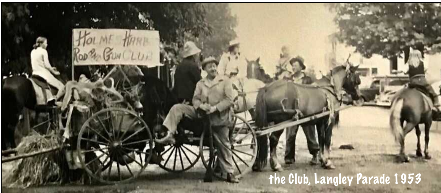
the Club, Langley Parade 1953

Prime Rib Friday the 6th Music, Dinner and Dance the 14th Silent Auction the 21st Halloween the 28th